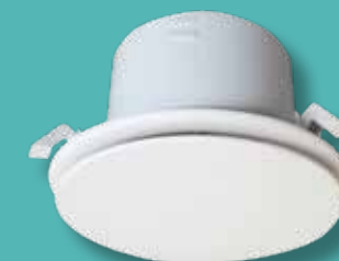
Slim Line Ceiling Diffuser