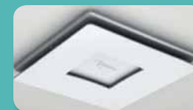
Standard Ceiling Diffuser

Drimaster is visually discrete with the only visible component being the central input diffuser which is usually mounted in the central hallway or stairwell ceiling. You have the choice between two types of diffusers, depending on your preference.