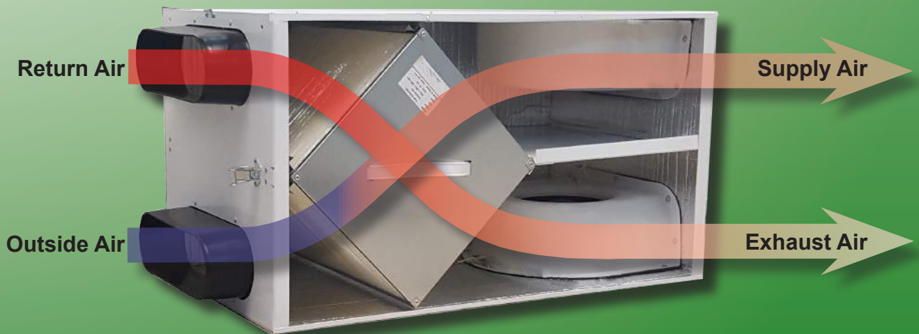
HEX390 Heat Exchange unit